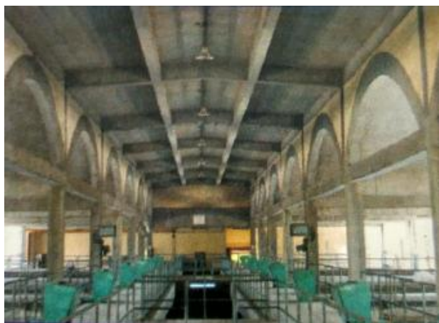
Filter House at Kotarpur WTP