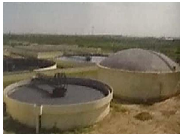
Pirana Sewage Treatment Plant