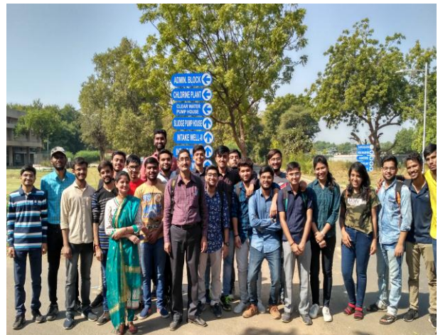
IITRAM Students at Kotarpur WTP site